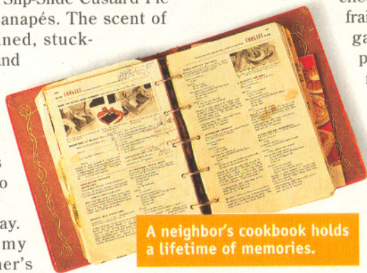
A neighbor's cookbook holds a lifetime of memories.